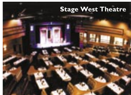
Stage West Theatre